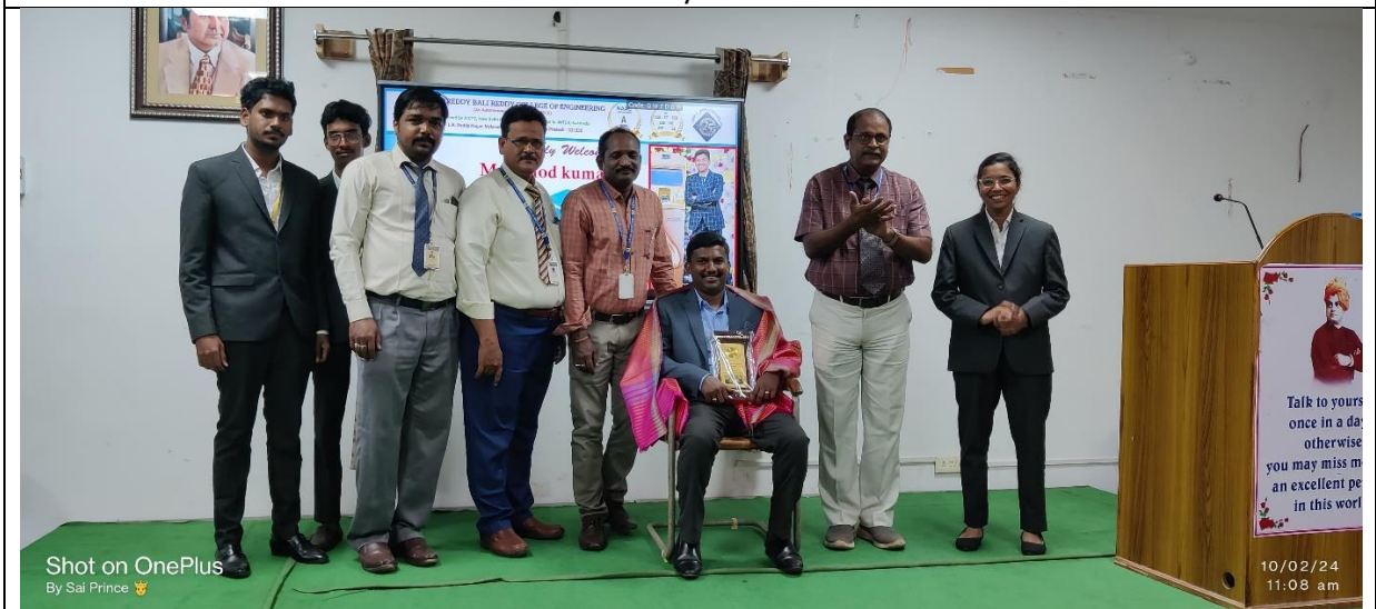
Felicitating the Chief Guest by the Deptment